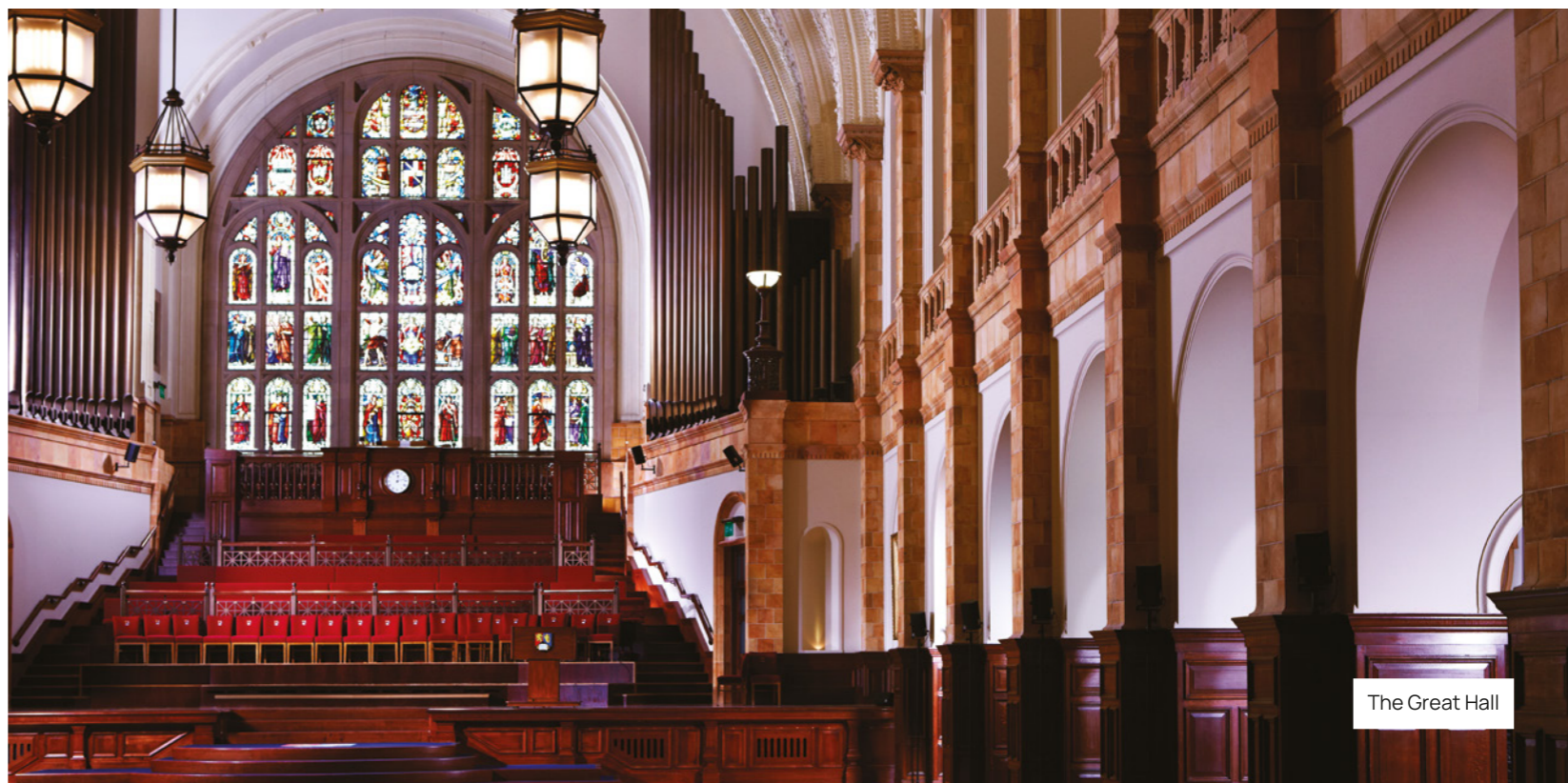
The Great Hall