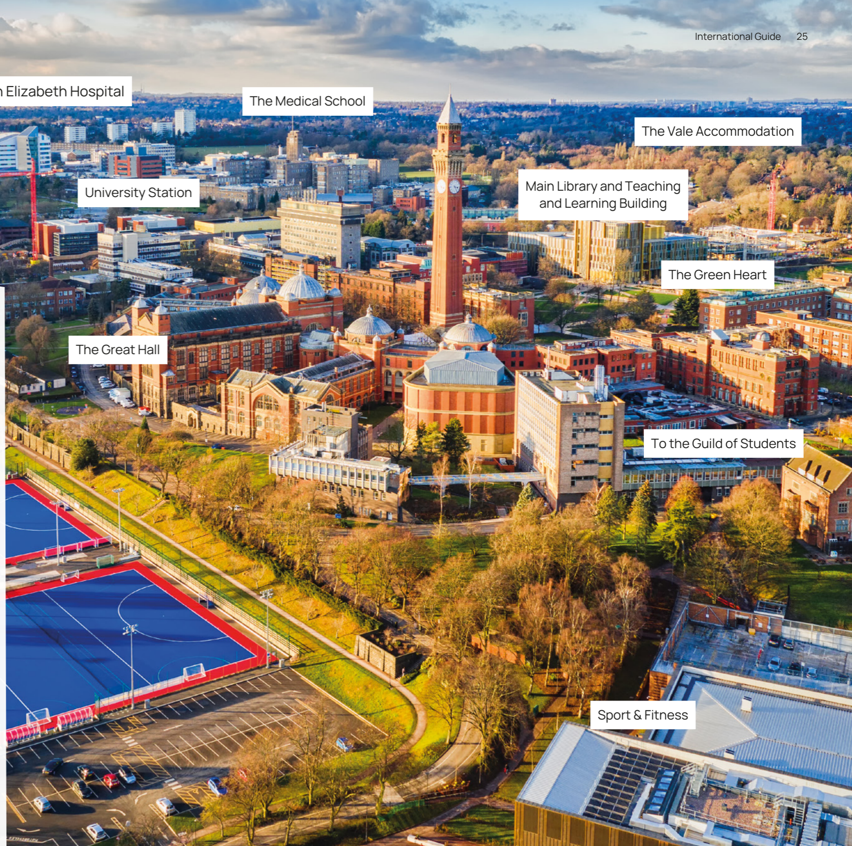
Sport & Fitness