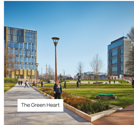
The Green Heart

Find out more about the student experience: birmingham.ac.uk/experience