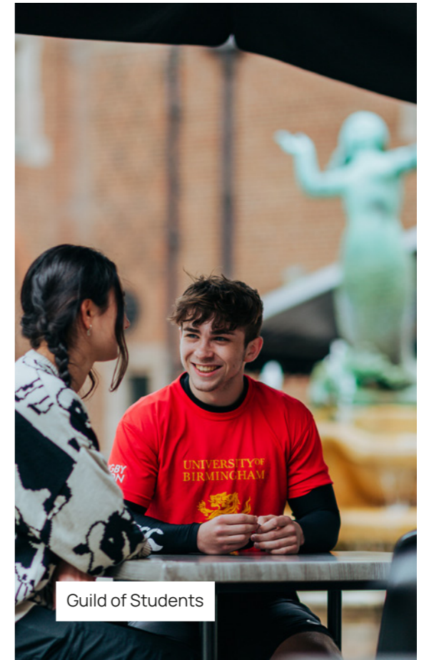
Guild of Students

Find out more about the student groups and societies: guildofstudents.com