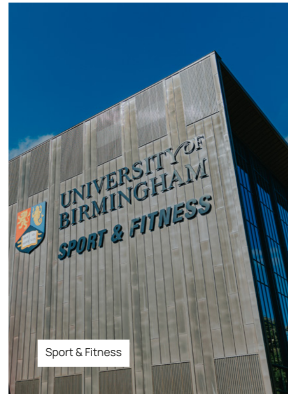
Sport & Fitness