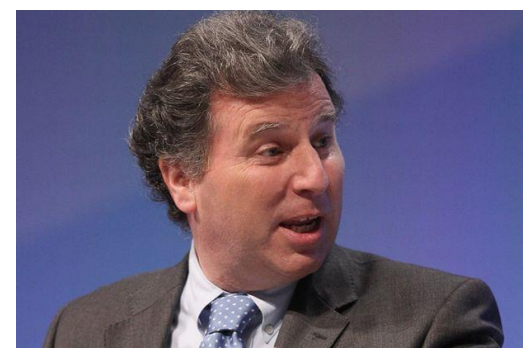
6 (Oliver Letwin)