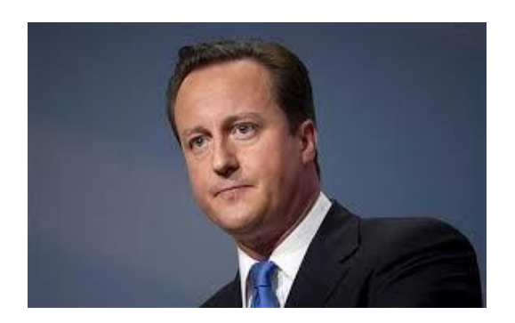
4 (PM, Big Society)