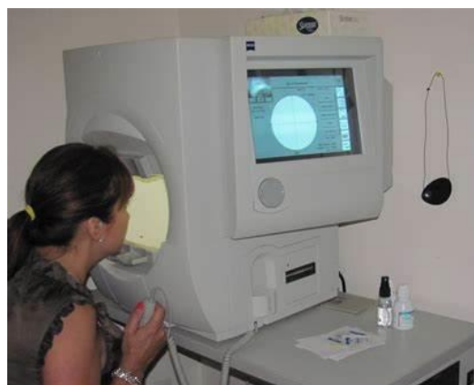
A Humphrey's Visual Field Analyzer