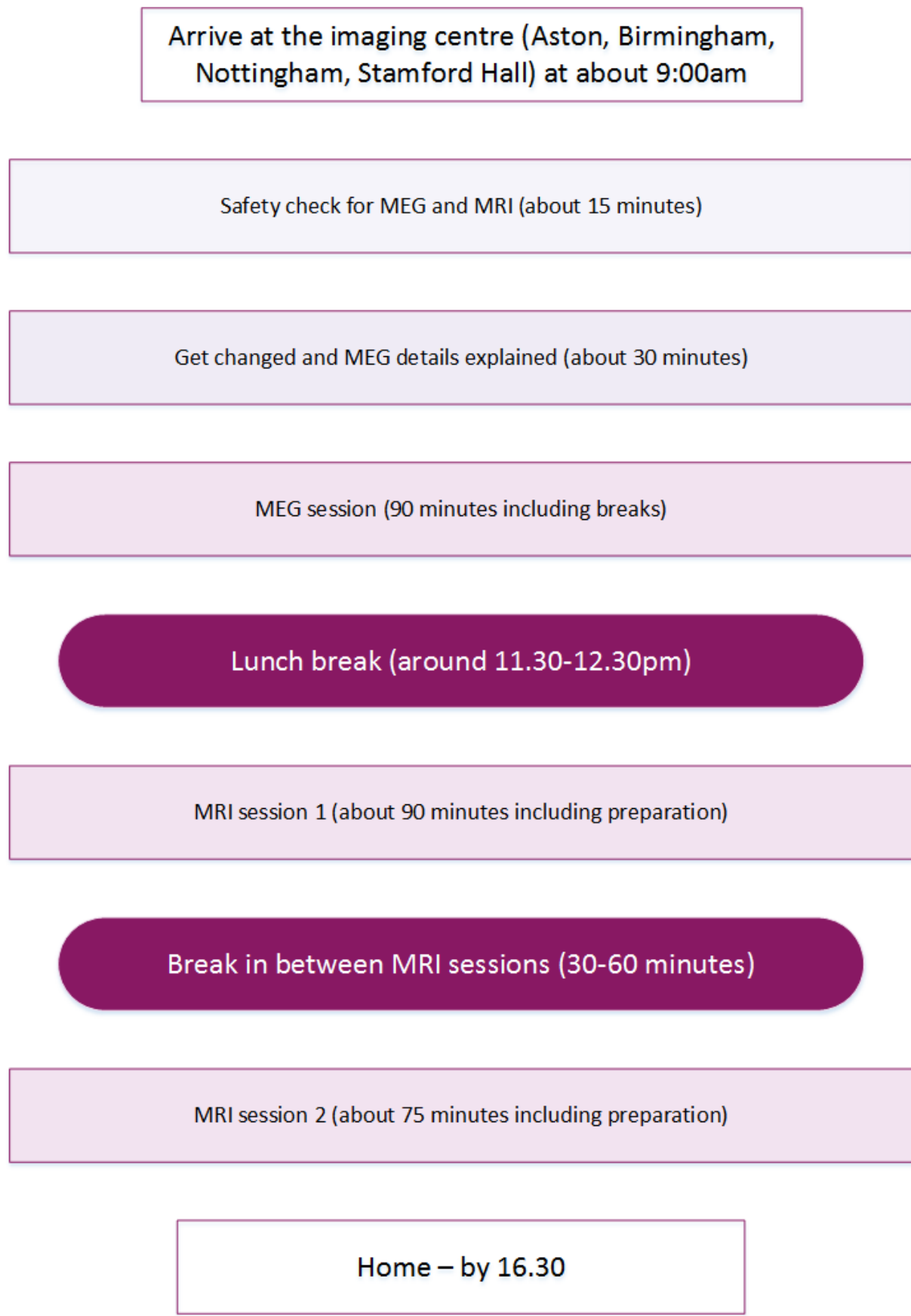
Figure 3 – Brain scan day