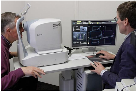
An Optical Coherence Tomography scanner