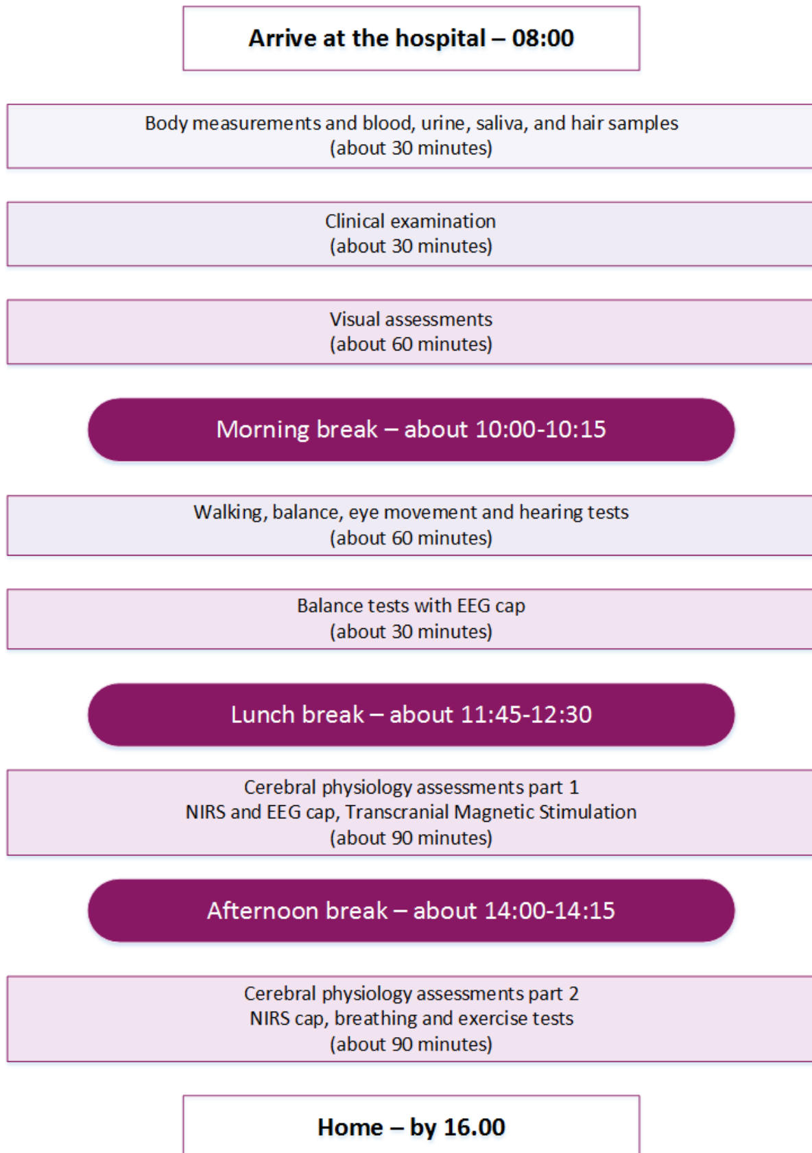
Figure 2 – Clinical day at the hospital