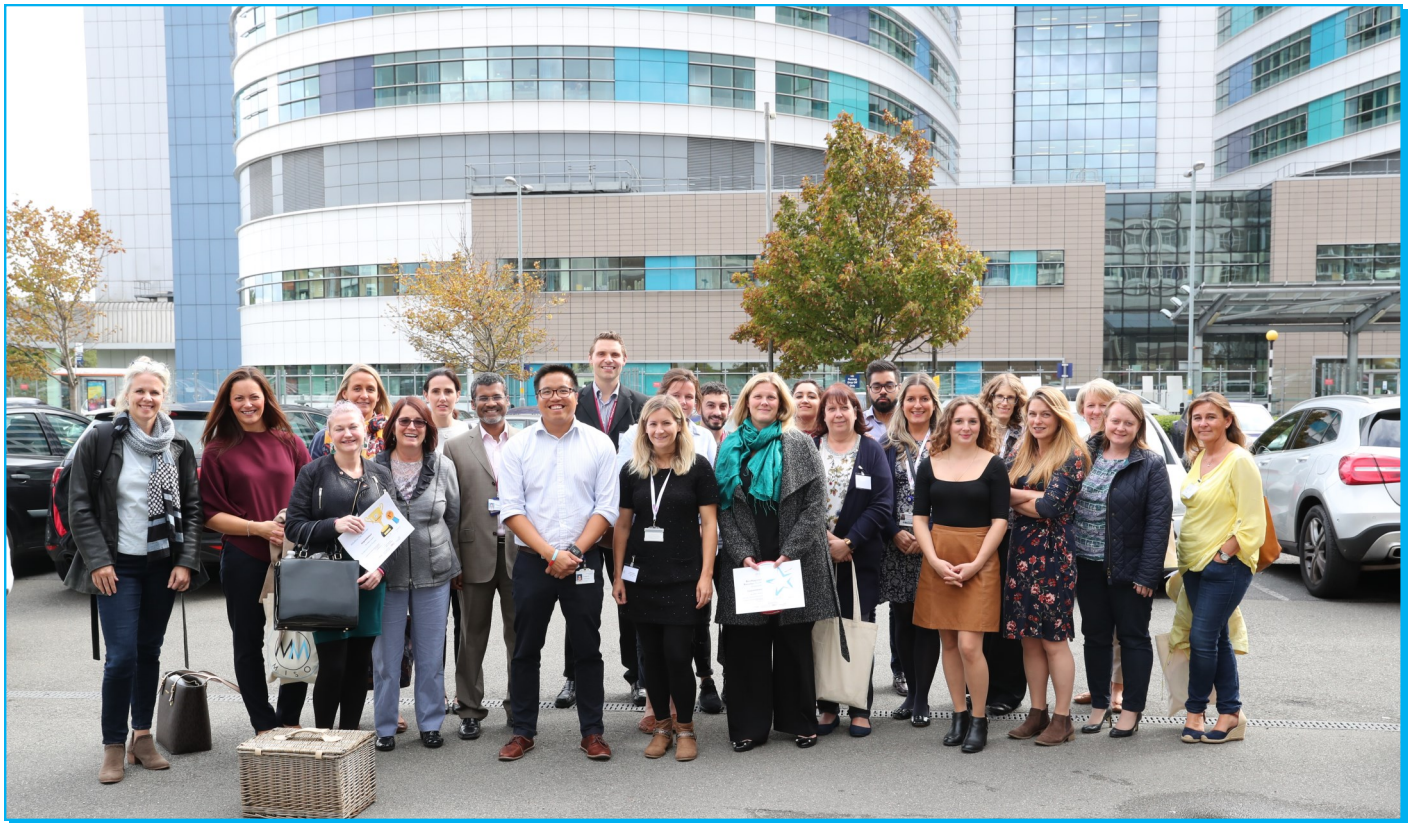
Group photo, MifeMiso collaborators meeting, 11/09/2018