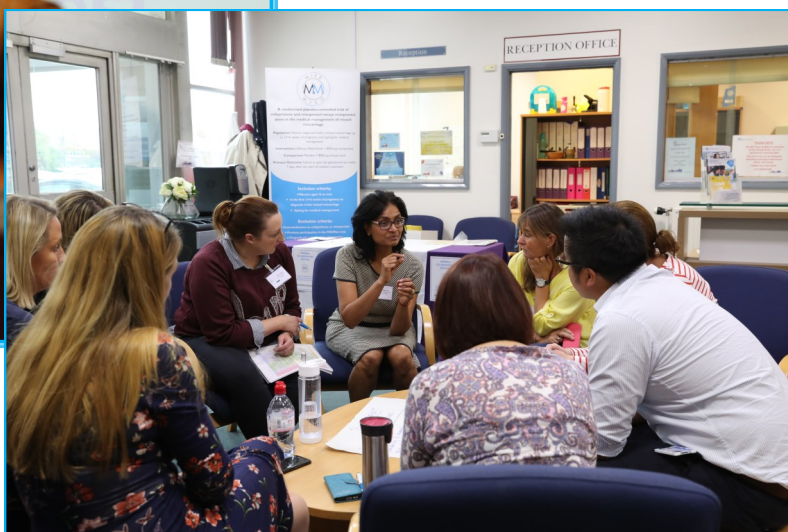
Discussions during the MifeMiso break out session